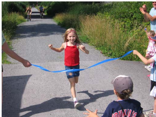
Kids participating in the Council's Fit Family Day