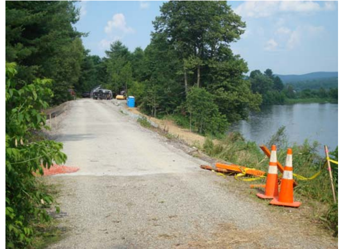
VTrans District 8 repaired the section of the MVRT near Mile Marker 17.5

VTrans District 8 was notified, and after an investigation, determined that the culvert beneath the trail had failed, resulting in a section of the trail sinking.