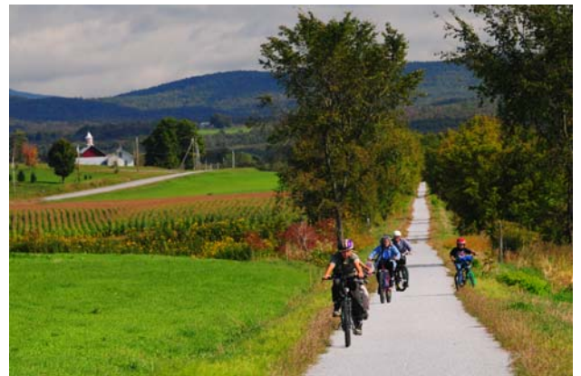
Bicyclists on the MVRT in Sheldon

Join Don Mueller and Phyllis Tiffany to bicycle along the Rail Trail from St. Albans to The Abbey Restaurant in Sheldon and return. Meet at the Rail Trail parking area in St. Albans (entrance off Route 7 just north of Route 105 inter-section), leaving promptly at 8 am. Distance: 22 miles round trip. Duration: approx. 4 hours. Level of difficulty: easy. Trail surface: crushed limestone (not suitable for narrow or racing tires). Bring your own bicycle/helmet, lunch/refreshments.