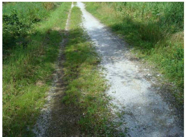
Vegetation is obliterating the trail

regain the original 10' trail width. A piece of fabric will be placed beneath the crushed limestone to prevent the fines from sinking into the ballast layer. The State is working on design documents and preparing the construction bid package. Construction is expected to take place in 2010.