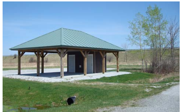
Bathrooms located beside the MVRT at Franklin Park West

At present, we are awaiting an engineer's opinion on what the daily water usage of the bathrooms would likely be. This figure will then be presented to the City Council for reconsideration of the fee applicable.