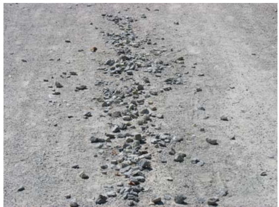
Ballast coming up through MVRT's crushed limestone surface

Plans at present are to add 3" of compacted crushed limestone to the existing surface and to