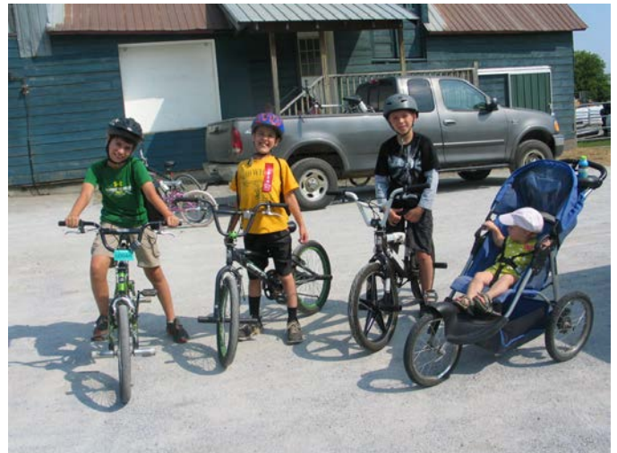
Fit Family Day participants in Enosburg Falls