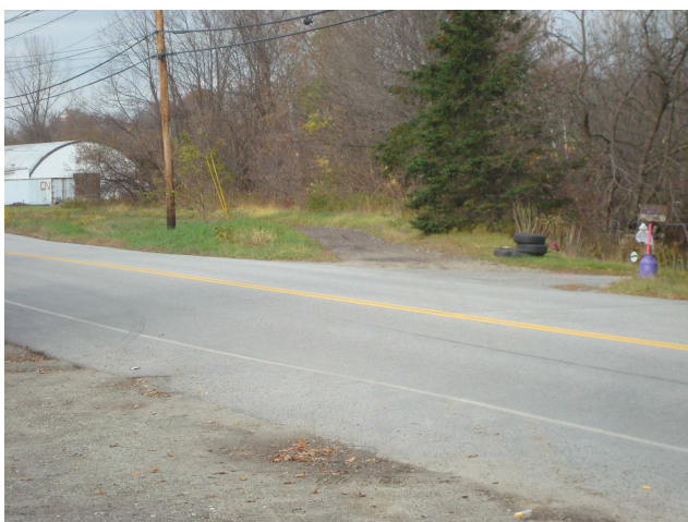
The MVRT (behind photographer) presently ends at Troy St. in Richford. The Town will be extending the trail along the former railroad bed seen above on the eastern side of Troy St.

The paved trail will extend a half-mile between Troy Street (where the MVRT ends) and the parking lot behind Wetherby's Quick Stop/Sunoco station on Main Street. The project will be paid for by a grant from the Vermont Agency of Transportation and is expected to be constructed in Spring 2014.