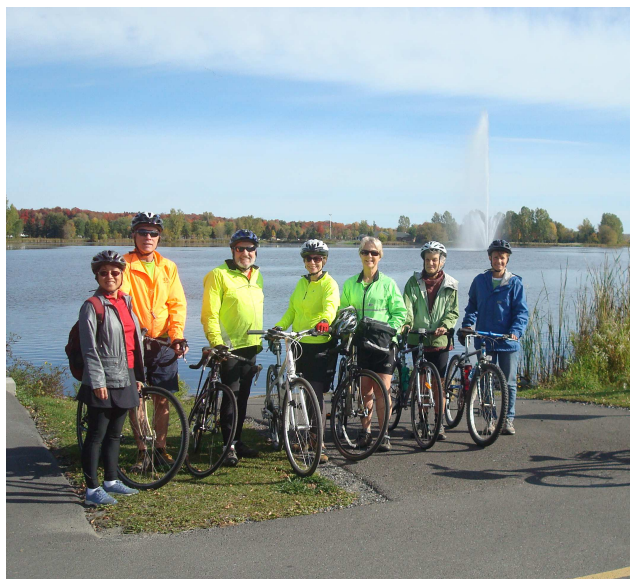
Fall Foliage at Lac Boivin in Granby, QC