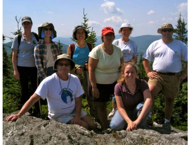
Hikers at the top of Burnt Mountain

reached the 2600' summit. The climb is about 2.4 miles each way with about 1,600' of ascent.