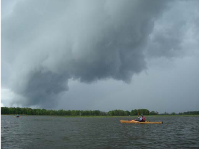
Paddling in Missisquoi Bay as a storm approaches

was some very fast paddling as people headed for the relative shelter of Dead Creek!