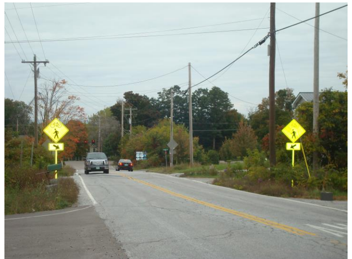
New signs on Seymour Rd. draw attention to MVRT crossing

And more good news – crossing Seymour Rd. in St. Albans (which separates the MVRT parking area from the start of the trail) has been made safer with the recent installation of improved signage. High visibility pedestrian crossing signs are now located on both the north and south sides of Seymour Rd. and face both east and west bound traffic. Thank you VTrans!