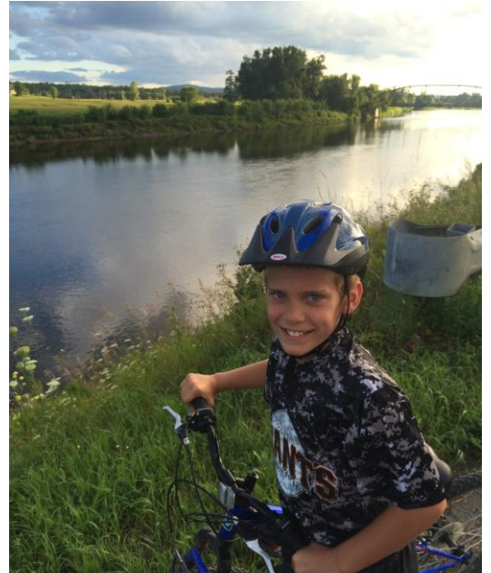
A member of St. Albans Boy Scout Troop 70 bicycling the MVRT

Missisquoi Valley Rail Trail. For this reason Boy Scout Troop 70 of St. Albans chose the Rail Trail for weekly summer rides with the younger scouts. The goal was to have the boys cycle on all parts of the trail from St.