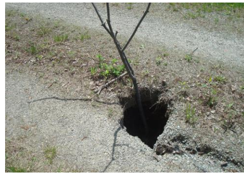
The MVRT's surface requires regular monitoring and maintenance to prevent holes like this one

The Council and the MVRT's many users greatly appreciate the efforts of VTrans