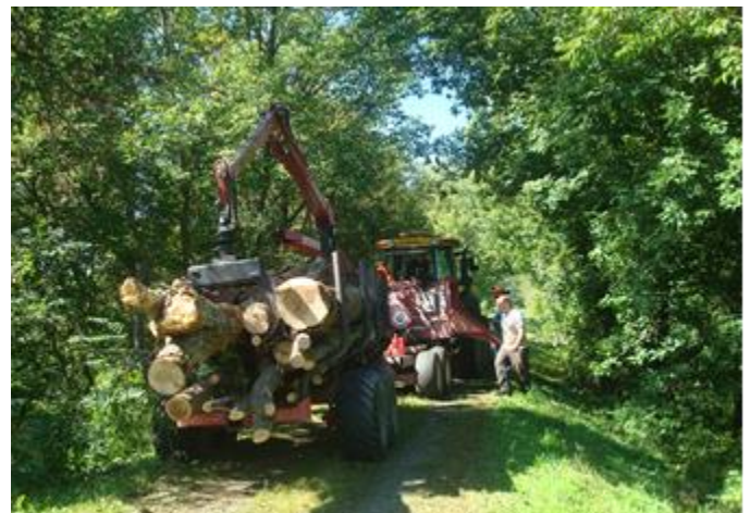
Dead trees and those overhanging the Trail surface are removed

good condition. In addition to keeping the shoulders mowed, removing fallen trees and branches, and filling potholes, several culverts were repaired or replaced, and encroaching trees were removed this summer.