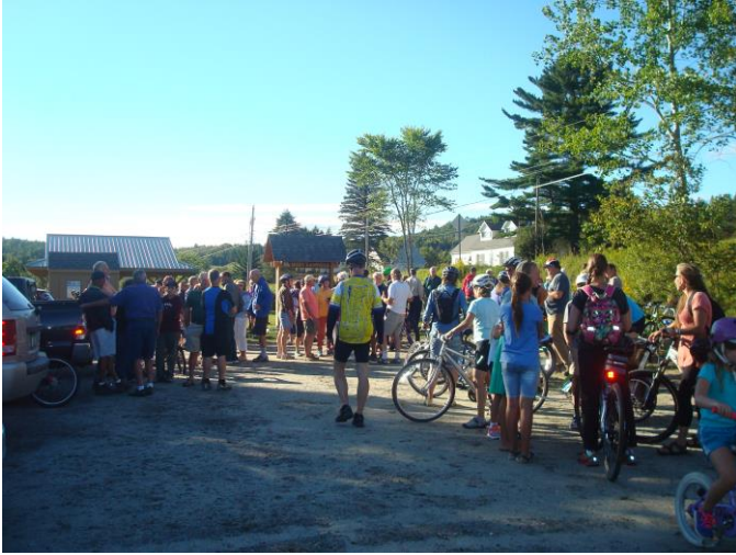
Many happy Trail users attended the official opening of the LVRT between St. Johnsbury and W. Danville

On August 27, a 17-mile section of the LVRT was officially opened! Stretching from St. Johnsbury to Joe's Pond in W. Danville, this section has a crushed stone surface and trail users pass through several huge culverts. The