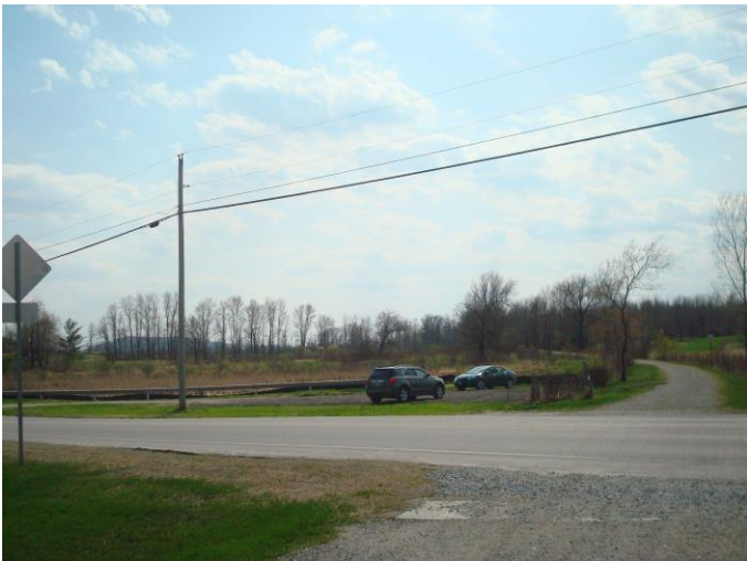
Improved MVRT parking area on Route 105 at Green's Corner

It's finally happened, the MVRT now has a new and improved parking area on Route 105 very near trail mile 3, commonly known as Green's Corner! Those of you who have been following the progress of this project might recall that the Council was originally awarded grants in 1998 and 2001 to develop several parking areas and install amenities. Parking areas in St. Albans