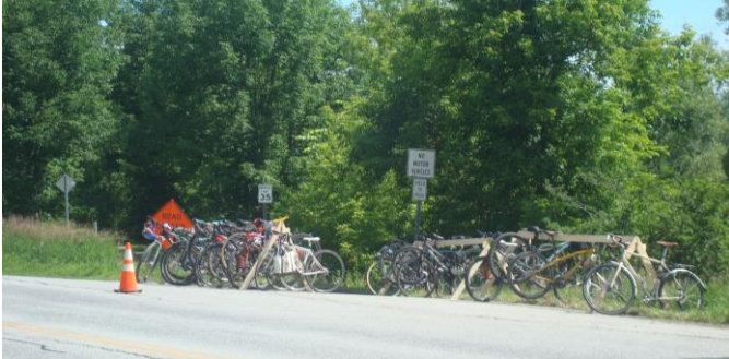
Bicycles in E. Berkshire wait for paddlers to become pedalers

This summer there was a lot of focus on the Missisquoi River and Franklin County due in large measure to the Upper Missisquoi and Trout Rivers receiving designation in the National Park Service's Wild and Scenic Rivers program. 'Celebrate the Missisquoi' brought